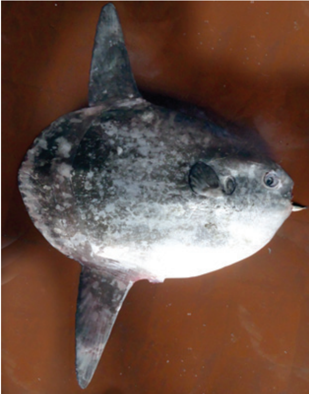
Fig. 1. Mola ramsayi landed at Munambam Fisheries Harbour

reported from Australia, New Zealand (Peque 1989) and southeast Atlantic. It has been reported earlier from Chennai (Mohan et al. 2006) in 2006 with a total length of 83.5 cm and weight 10.5kg. This is the first report from the Eastern Arabian Sea and also the largest specimen recorded from Indian waters. The fish is said to attain 300 cm TL (Heemstra 1986). The present report contributes to the extended distribution of the species.