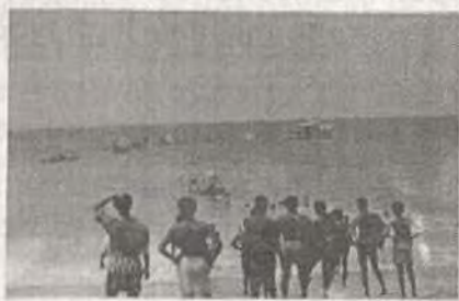
Catamarans with modules being towed to the reef site (Poovar, Trivandrum)

which attracts the fishes and fish food organisms to the reef area. This sudden availability of food in the reef provides sufficient food to the larvae and fingerlings of many organisms. The fishermen knew this since time immemorial and this is widely practiced both in fresh water as well as marine environments for aggregating fishes. This is also widely practiced by fishermen for catching the cuttle fishes and squids in north malabar coasts.