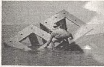
Modules sliding down to reef site (Thikkody, Kozhikode)