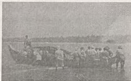
Coconut leaves being transported to the reef site

Artificial reefs increase the fish availability in the costal waters and thereby increase the employment opportunity of the artisanal fishermen. AR's also play a greater role in conserving the resources by preventing mechanized vessels fishing in the inshore