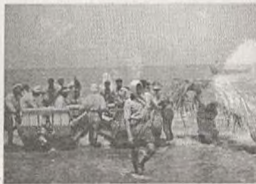
Enriching the reef with materials of plant origin increases the productivity

Fishing in the artificial reef is normally restricted to a 6-month period starting from October and ending in March. After the post monsoon season there is a gradual decrease in the catches in the inshore waters starting from October, locally known as Panjamasom (means months of starvation). It is during these months that the fishermen depend on the artificial reefs for their livelihood. Fish catches in the reef decreases from February and by March catches will be very poor. Whereas fish catches in the open waters increases from February onwards and fishermen move from reef area to open waters during these period. Thus the traditional fishermen regulate the exploitation of the resources in the reef area and open waters judiciously throughout the year. This conservation minded exploitation protects the resources to a greater extend. However whenever the mechanized fleet invades the coastal waters this balance disappears.