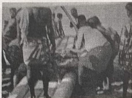
Modules being loaded onboard a catamaran (Vizhinjam, Trivandrum)

slab of the module is fabricated separately and joined later after completing the curing of the concrete. Curing is normally done for 12 days. Each slab of 1.5Mx1.5M is provided with a middle window of 0.60Mx0.60M. Dried slabs are joined together to form either triangular modules or rectangular box type modules as the case may be. While fabricating the modules care may be taken to maintain the cement, sand, jelly ratio as 1:2:4 for greater strength. While joining the slabs 2 mm tying wire is used for strong corners.