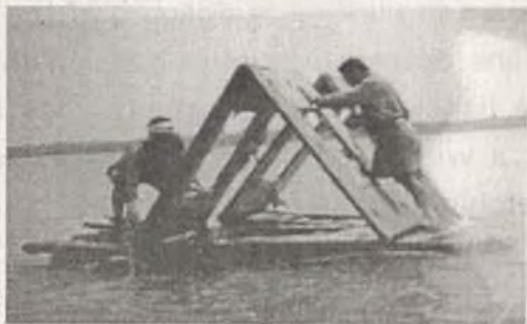
Arranging the catamarans on the raft before towing (Moodady, Kozhikode)