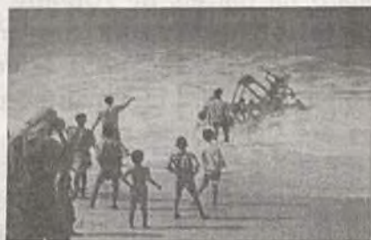
Module loaded Catamaran pushed beyond wave breakers (Vizhinjam II, Trivandrum)

the reef. The best way to overcome this problem is by enriching the reef by dumping plant materials like coconut leaves, coconut stumps, palm leaves, freshly cut branches of trees or additional modules into the area. Plant material when decays, especially coconut or palm leaves, exudes a typical smell