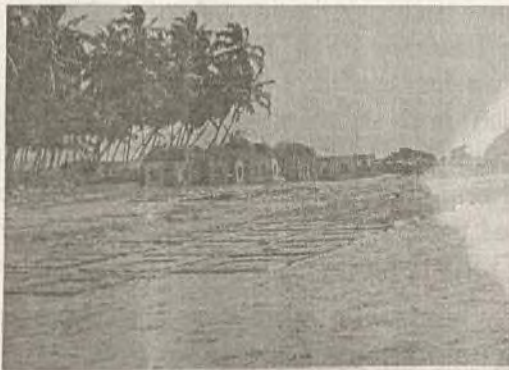
Triangular modules ready for transportation (Poovar, Trivandrum)

In the United States, the earliest recorded history of AR construction dates back over 150 years. Reef building in the United States was initially promoted for sport fishing interests. Today AR's are constructed for sport fishing, commercial fishing, resource management, environmental mitigation, waste disposal and recycling, sport diving and tourism . In Thailand AR's deployed adjacent to the coastal villages show increase in biomass and species diversity and substantial increase in the catches of traditional fishermen. In Philippines the use of Payaous increased the tuna catches tremendously. Payaous had improved exports and fishermen's status, reduced conflicts between artisanal and mechanized fishermen and increased local consumption of Tuna. In Sri Lanka and Maldives use of FAD's are still in the experimental stages only.