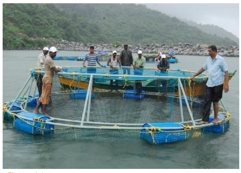
Photograph 4 Open sea cage farming