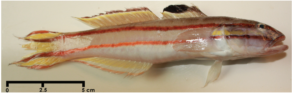
Figure 1. Valenciennesa helsdingenii , 145 mm SL from the Gulf of Mannar, southeast coast of India.