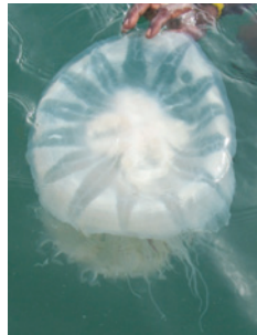
Rhopilema cf. hispidum