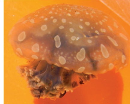
Mastigias cf. papua (Lesson)

Four species of scyphozoan jellyfishes have been recorded from Palk Bay and Gulf of Mannar viz., Cassiopea cf. andromeda (Forsskål, 1775), Chrysaora caliparea (Reynaud, 1830) [species inquirenda ], Mastigias cf. papua (Lesson) and Rhopilema cf. hispidum . The species Cassiopea cf. andromeda has been recorded from Tuticorin coast and the remaining three species have been recorded from Mandapam and Thiruppalaikudi coast of Palk Bay. The Rhopilema sp. is an edible jellyfish and are commercially harvested for export market. All the species of the genus Chrysaora can inflict painful stings and cause severe scars.