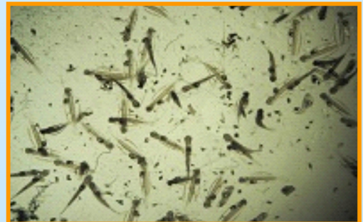
Aviary of larva