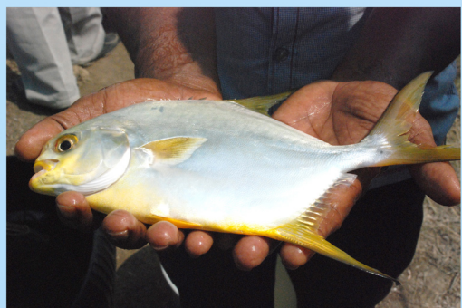
Sampled pompano weighing 250 gram