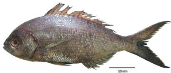
Paracaesio sordida Abe & Shinohara, 1962

Meristic characters: D X, 10; III, 8; P 15; V I, 5; C 18; LL 69-72; GR 9+21; BR 6