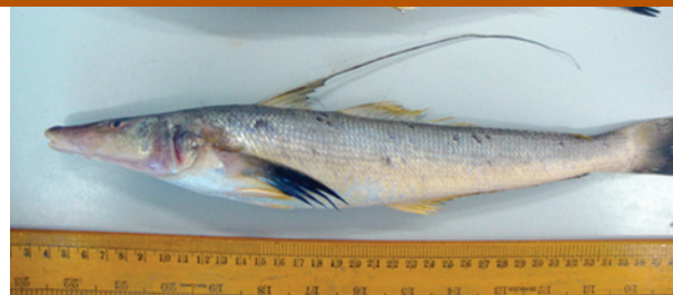
Sillaginopsis panijus landed at Kasimedu Fishing Harbour, Chennai

Morphometric measurements of Sillaginopsis panijus collected from Kasimedu Fishing Harbour, Chennai