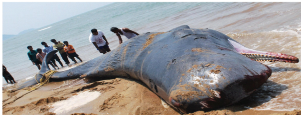
Fig. 1. The sperm whale Physeter macrocephalus stranded at Devbagh, Karnataka

17.9.2009 around 1730 hrs struggling to escape from the shallow waters. The total length of the whale was 990 cm with an approximate weight of 12 t. The whale was suspected to be injured due to collision with