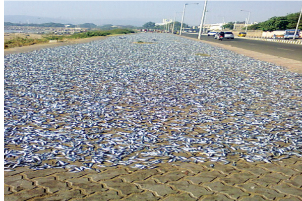
Fig. 2. Juvenile oilsardine being sun dried at Jalaripeta, Visakhapatnam

A detailed analysis on the biology revealed that all the fish were indeterminates in both the months. The study on food and feeding showed that most of the individuals had half filled stomachs. The juveniles were sold at ₹ 8 per kg wet weight and at ₹ 20-22 per dry weight to the local fish meal agents. Their average