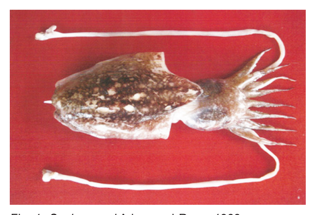
Fig. 1. Sepia omani Adam and Rees, 1966

Twelve specimens of S. omani were analysed for further biological characteristics. The stomach condition was ascertained as per Kore and Joshi (1975). The Index of preponderance was estimated as suggested by Natarajan and Jhingran (1961). Majority of the guts were empty and the food was in finely macerated condition. The species seems to mainly feed on fish (80%) followed by prawn (20%). Majority of the specimens were immature. The species was not observed in the catch thereafter and the present observation appears to be a rare occurrence.