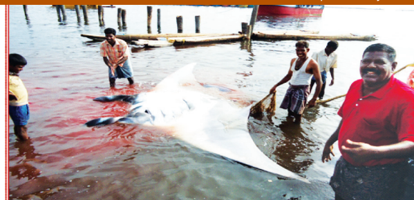
Fig. 2. Mobula diabolus landed at Chennai