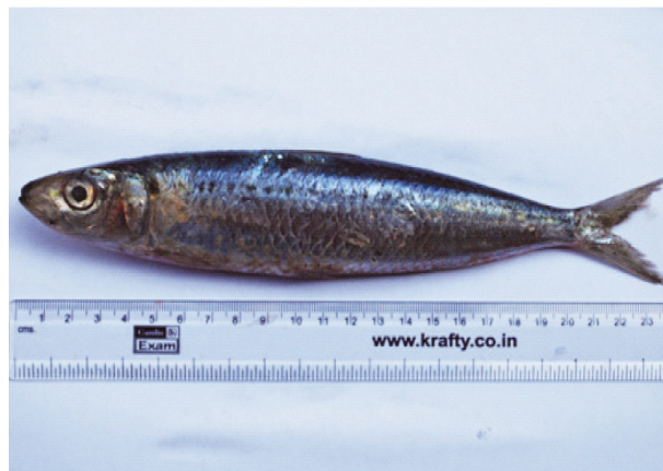
Fig. 1. The unusually large size oil sardine ( Sardinella longiceps ) landed at Karwar