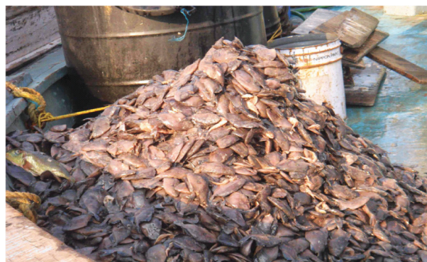
Fig. 3. Triggerfish heap on the deck of trawler