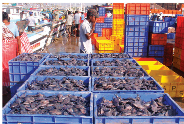
Fig. 4. Triggerfish ready for transportation