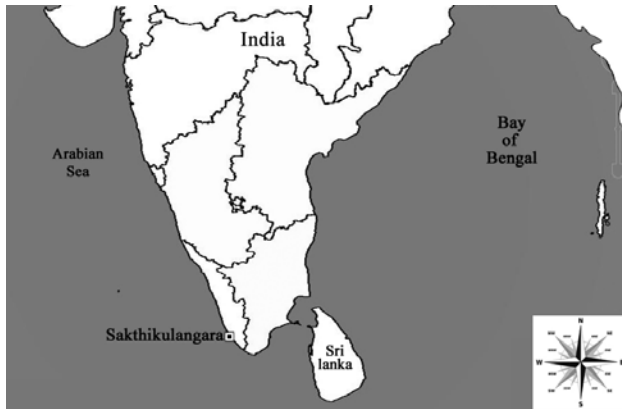
Fig. 2. Map showing collection locality

are H. septemfasciatus , H. mystacinus and H. ergastularius (Table 1). H. septemfasciatus differs from H. octofasciatus in having comparatively lesser body depth and slender caudal peduncle; six dark bars below dorsal fin and three interspaces between bars below soft dorsal fin (5 dark bars below dorsal fin and 2 interspaces between bars below soft dorsal fin in H. octofasciatus ). E. mystacinus differs by a shorter pelvic fin than pectoral fin and narrow dark bar on the body. H. ergastularius is readily distinguished from H. octofasciatus by the truncate to slightly emarginated caudal fin (rounded in H. octofasciatus ) and broad pale margins of the fins; the white interspaces between second, third and fourth, fifth bars are narrow than third, fourth and fifth, sixth bars (all the spaces are in same size in H. octofasciatus ) (Heemstra and Randall, 1993; Randall et al., 1993). The meristic and morphometric measurements of the present specimen matches well with that of Heemstra and Randall (1993) (Table 2). Since no detailed account of this specimen is available from Indian waters, the occurrence of this fish can be taken as a new record from Indian waters.