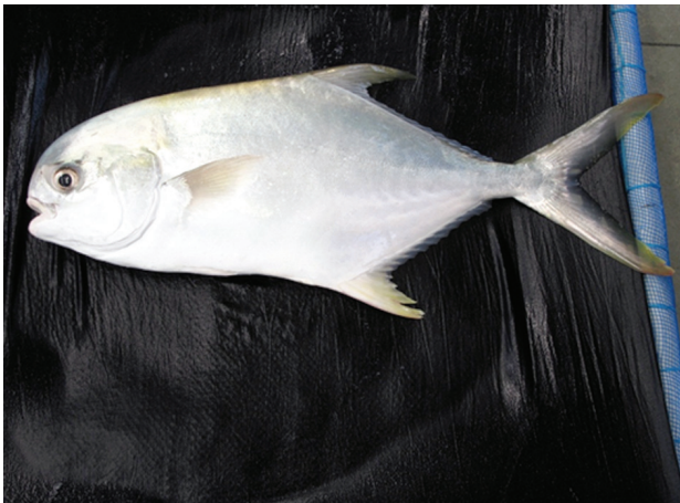
Fig. 1. Pompano brooder

E 79°7'98.1"). The wild caught fishes were initially stocked in the cage without separating the sexes. These fishes were fed once in a day with low value fish (sardines, Pellona and Ilisha sp.) and squid at about 2.5 % of their body weight. Vitamins and mineral premix packed in 1 g gelatine capsules were also given twice a week along with feed at the rate of 1% of the food ration, in order to take care of the nutritional deficiencies. A total of 50 fishes with initial weight ranging from 250 to 500 g were stocked. The fishes were reared to maturity and when the fishes reached around 1kg size (Fig. 1), they were cannulated, sexed and tagged with passive integrated transponder (PIT) tags after anesthetising.