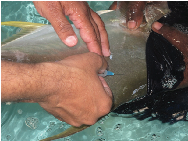
Fig. 5. Administration of hormone

percentage were determined from 3 one-litre aliquots. The brooders after each spawning were maintained under the same photoperiod regulation throughout the experiments. A total of 5 controlled breeding experiments were conducted during July- December 2011.