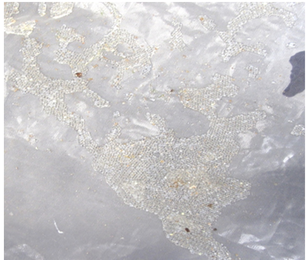
Fig. 6. Eggs sieved from the spawning tank

The pre-conditioning of fishes carried out under photoperiod control, for a period of two months, accelerated the development of intra-ovarian eggs from <math><100 \mu</math> size to