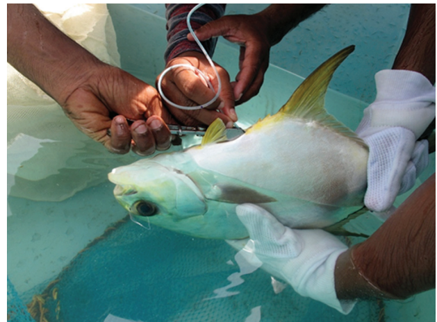
Fig. 3. Cannulation of brooder