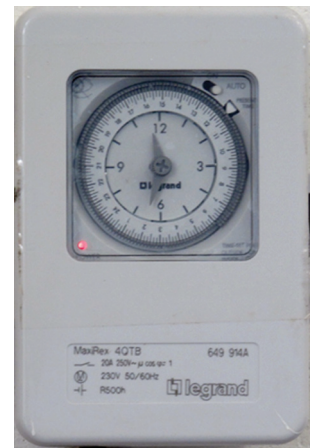
Fig. 2b. Analog timer