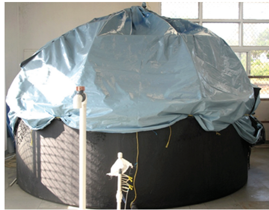
Fig. 2a. Broodstock tank with photoperiod control

After rearing for about one year in the cages, twelve numbers of fishes weighing above 1.5 kg were selected, brought to the hatchery, treated with 100 ppm formalin for 2 – 5 min, quarantined for about 48 to 72 h and stocked in two FRP tanks of 10 t capacity each with flow through system (flow rate 2 t h -1 ). They were fed ad libitum twice a day with squid, shrimp and fish roe along with vitamin pre-mix. After a period of two months, four fishes (1 female and 3 males) were selected based on the gonadal condition and transferred to an FRP tank of 10 t capacity with photoperiod control facility (14L:10D) for pre-conditioning the fishes for sexual maturation (Fig. 2a, b). A compact fluorescent lamp (CFL) of 85 W fixed inside a protective dome was used for maintaining light intensity. The light intensity was recorded as 2000 lux at 1.20 m, measured using an underwater lux meter. The size of the female was 13.8 cm in total length and having a weight of 2.245 kg. The total length of males ranged from 30.7 to 35.7 cm and weight from 1.750 to 2.1 kg. The water quality was maintained by providing a continuous flow-through system. Periodic cannulation (Fig. 3) of the female was carried out to assess the progress of maturity of the fishes.