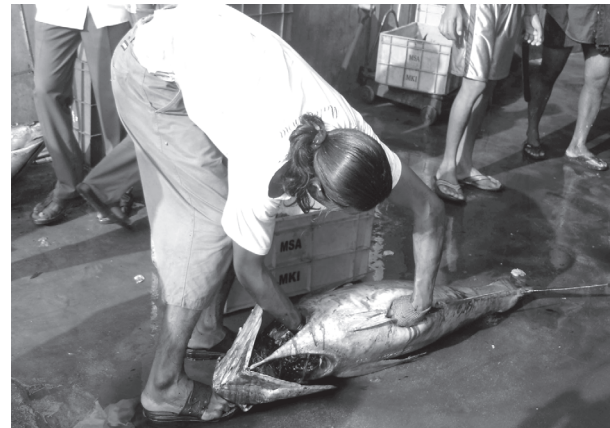
Fig. 2. Gillrakers and stomach being removed from yellowfin tuna

Rs. 80 per kg. Fishes were cleaned, gill rakers removed and degutted (Fig. 2). The cleaned fish were transported to Kerala for high value export market .