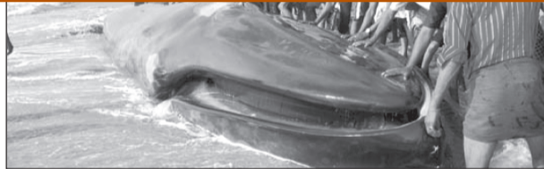
Blue whale washed ashore at Kuttayi Landing Centre, Malappuram

On 27 th February 2010, a blue whale, Balaenoptera musculus , measuring 31 feet in total length was washed ashore at Kuttayi Landing Centre in Malappuram District of Kerala.