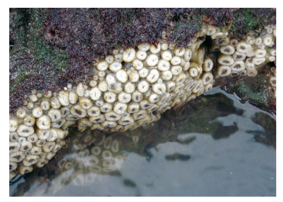
Fig. 1.Bleached Zoanthus at Thikkodi intertidal region on 21 May 2010