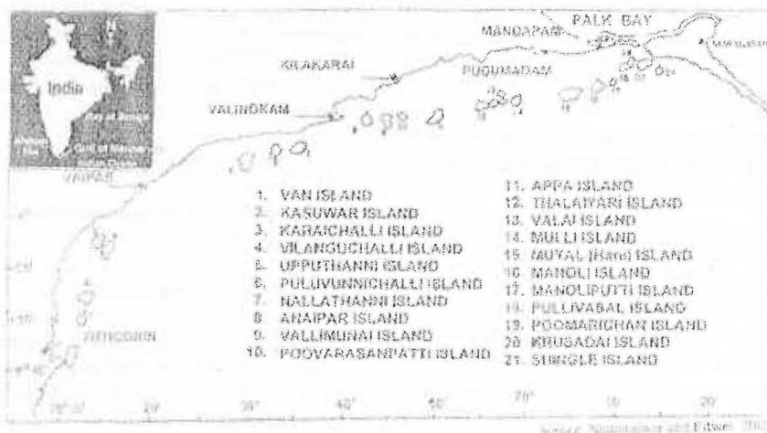
Fig. 1. Map of Gulf of Mannar showing the Islands