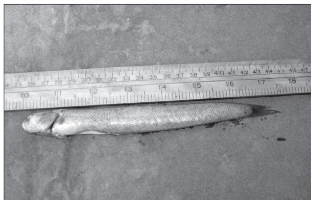
Fig. 3. Trypauchen vagina