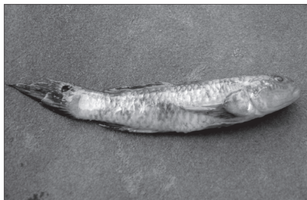
Fig. 4. Parachaeturichthys polynema