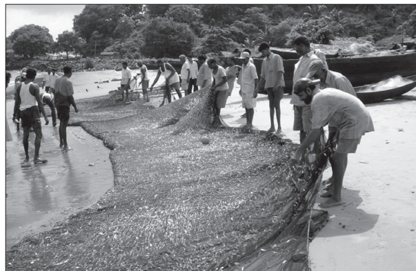
Fig. 2. Hauling the shoreseine

15-20 minutes. The net is hauled immediately after the dhoni reaches the end point. The hauling process is completed in 1½ to 2 h (Fig. 2).