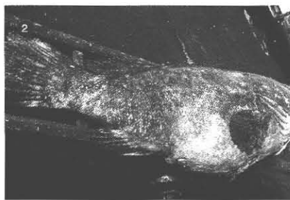
Fig.2: Ventral view of Promicrops lanceolatus (Bloch,1970) landed at New Ferry Wharf, Mumbai on 16.12.2006