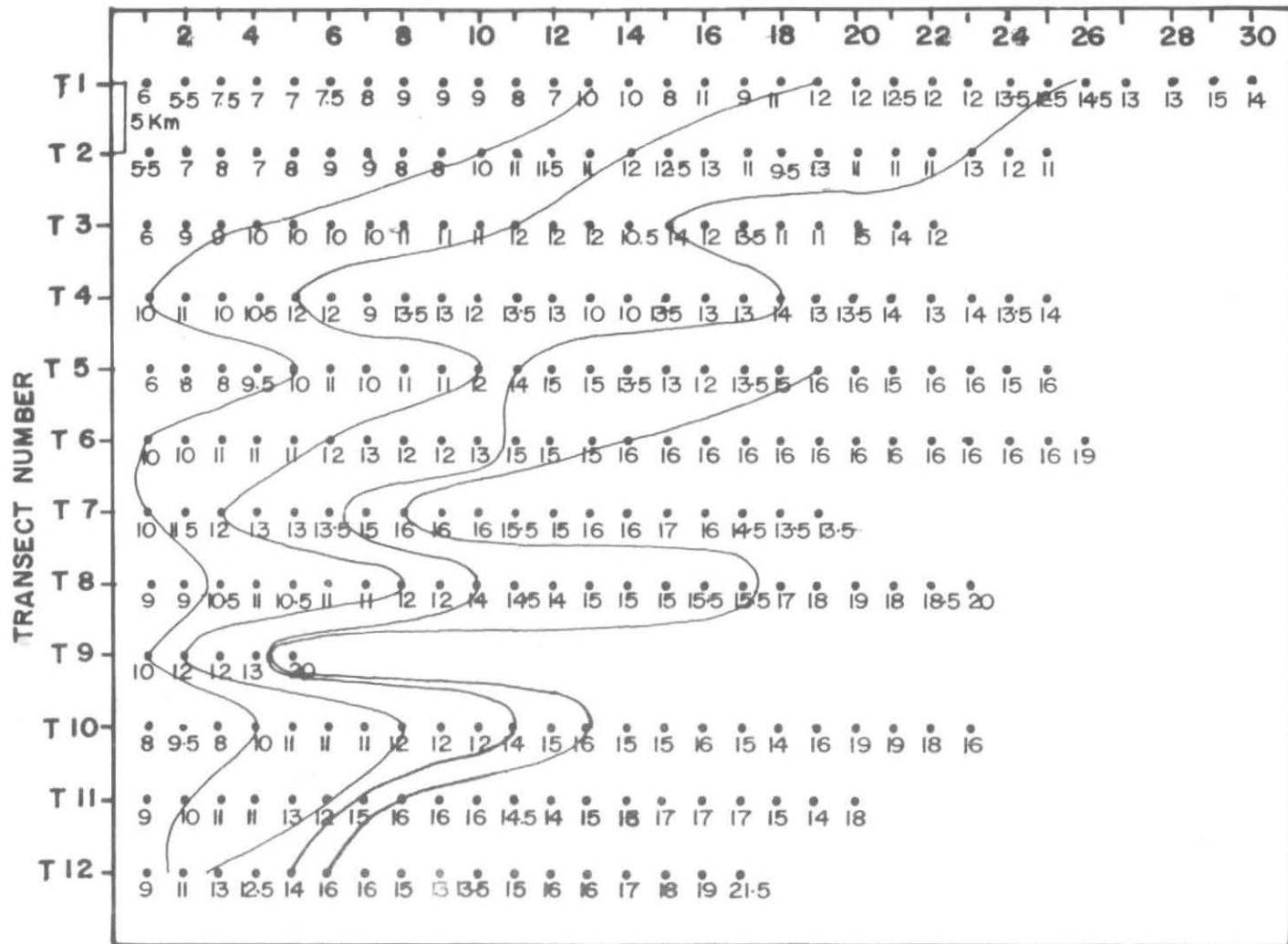
Contour map showing the depths of stations surveyed Stations with vegetation along the transects.