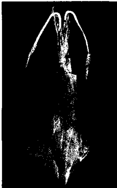
The common Indian squid, Loligo duvauceli

Loligo duvauceli among squids and Sepia pharaonis among cuttlefishes are the two species that support the cephalopod fishery along the Kerala coast. They together form about 85%, and the rest is contributed by Doryteuthis sibogae , D. singhalensis (squids),