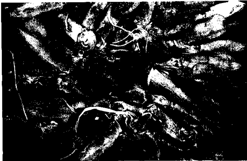
A squid catch by trawl net; a few numbers of small cuttlefishes also can be seen

Kerala's share of all-India cephalopod production has been the highest in most of the years ranging