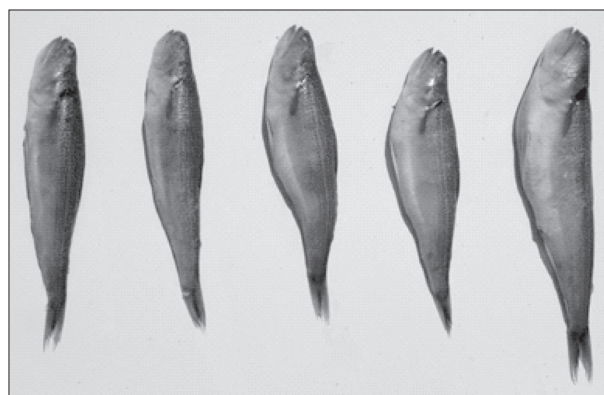
Fig. 1. Trachinocephalus myops

Occurrence of T. myops along the coast of Visakhapatnam is seasonal. During the year 2006-'07 the annual average production of T. myops was 2.4% of the total lizardfish production at Visakhapatnam. Females ranged in size from 136 to 228 mm and males from 142 to 145 mm in total length.