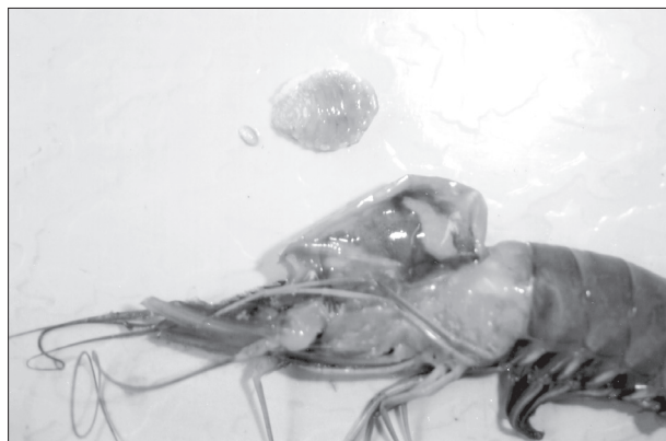
Fig. 1. Bopyrid parasites (female and male)

The parasites were detected during the regular weekly sampling of shrimps and crabs landed by trawl nets at Kasimedu (Madras) Fishing Harbour. Sixty five females (total length range: 63-103 mm) and 50 males (total length range: 56-95 mm) of Metapenaeopsis stridulans , two males of Metapenaeopsis mogiensis (71 and 99 mm in TL), five specimens (three females, 55-85 mm TL and two males, 70 and 72 mm TL) of Parpenaeopsis stylifera and one specimen of Parpenaeopsis maxillipedo (120 mm in TL) infected with bopyrids were obtained in trawl catches from September 2006 to March 2008. The bopyrid parasite was identified as Epipenaeon ingens . The female is oval in shape (Fig.1).