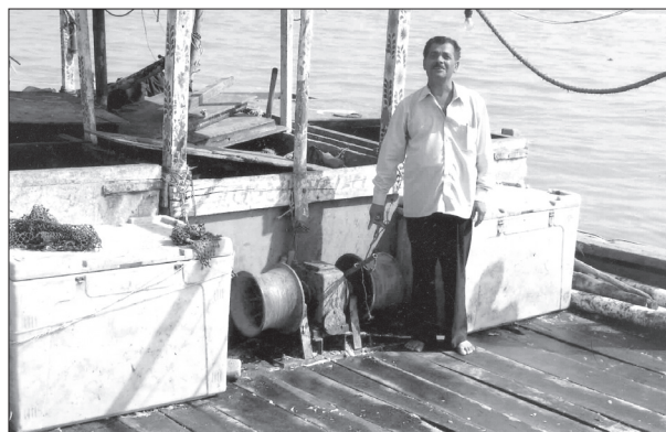
Fig. 1. Improved mechanisation in dolnetting along the Saurashtra coast