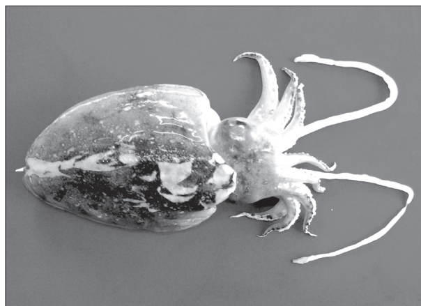
Fig. 1. Sepia elliptica Hoyle, 1885

Some of the important distinguishing characters of S. elliptica are as follows: The mantle is oval with the dorsal anterior margin triangular. The arm length is sub-equal and the arm suckers are tetra serial. Club sucker-bearing surface flattened, with 10-12 minute suckers in transverse rows. Swimming