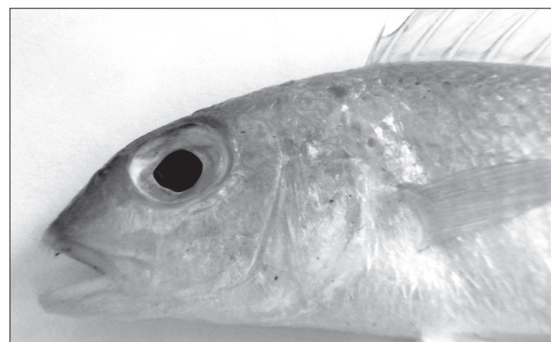
Fig. 1. Nemipterus zysron

Threadfin breams, a major demersal resource of Visakhapatnam region is represented by a single genus Nemipterus and is fished extensively by trawlers. Five species of this genus viz., Nemipterus mesoprion , N. japonicus , N. delagoae , N. luteus and N. tolu generally contribute to the fishery of the region. A sixth species, Nemipterus zysron was collected and identified from the catch at Visakhapatnam Fishing Harbour on 15 th July 2008. N. zysron is being recorded in the catch for the first time along Andhra Pradesh coast and was observed as a stray catch along with other commonly occurring threadfin breams. The species popularly known as slender threadfin bream had been misidentified and known with the following synonyms - Synagris metopias Gunther, 1859; Dentex metopias Bleeker, 1857; Dentex zysron Bleeker, 1857; Heterognathodon petersi Steindacher, 1866; Nemipterus metopias (Bleeker, 1857); Nemipterus nemurus (Bleeker, 1857) and Nemipterus petersi (Steindachner, 1866). However, none of these names are valid now (Fishbase). N. zysron was easily identified in the field by the slightly elongate body as compared to other Nemipterus species and the presence of yellow stripes in front of eye through nostrils and from