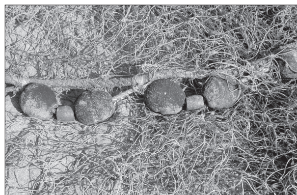
Fig. 2. Roller net showing rollers

It is a modified type of net developed by the Central Institute of Fisheries Technology for operating in uneven grounds. The gear is attached with rollers or wheel-like structures on the foot rope. The rollers or wheel-like structures are made up of wood or rubber. Unlike ordinary trawlnets, this net can easily roll over the coral reef or rock without much damage to the net. The mesh size of the cod end is around 20 mm. Usually, for fishing, the fishermen leave the shore by 1300 – 1500 hrs and come back by 1030 -1630 hrs the next day. The depth of operation