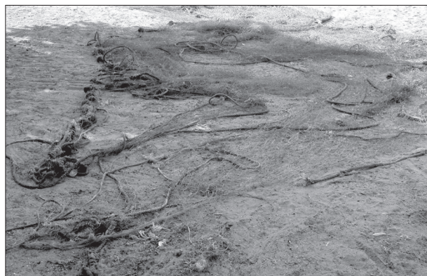
Fig. 1. Roller net

Trawling in this area is being carried out by a special type of trawl net called roller net, locally known as 'Roller madi' (Fig.1 and 2).