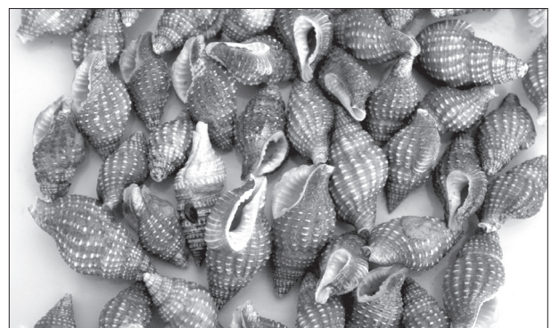
Fig. 2. Nassaria nivea