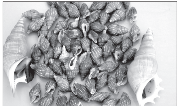
Fig. 1. Catch of Nassaria nivea and Tibia fusus

Two species of gastropods were identified in the landings - Nassaria nivea and Tibia fusus (Fig. 1 and 2). The maximum shell diameter (MSD) of N. nivea ranged from 0.81 to 1.40 cm and weighed 1.1 g to 5.2 g. A 15 kg basket of N. nivea was sold at the landing centre for Rs. 200/- and T. fusus for Rs.150/-.