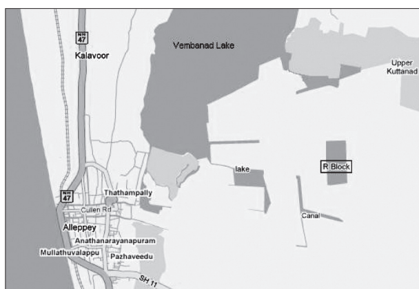
Fig. 1. Map showing R-Block

R-Block is an island in Kuttanad Taluk (Fig. 1) reclaimed from the Vembanad backwaters with mudwall embankments. About 200 fishermen from Kavalam village are involved in the black clam fishery of Kuttanad backwaters surrounding R-Block.