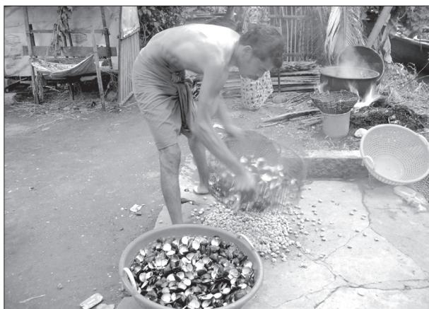
Fig. 4. Separation of cooked clam meat

grow and reproduce before capture. This ensures sustainability of the fishery, besides assuring fishermen a higher average price for the uniformly large size clams fished. Other black clam fishing communities in Vembanad Lake have to follow similar