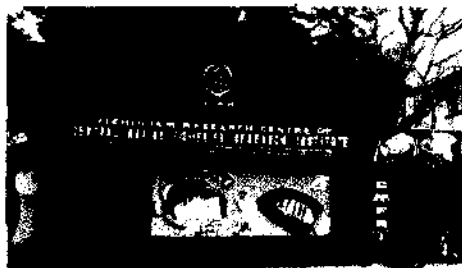
A view of the CMFRI stall

A marine aquarium stall was set up by Vizhinjam Research Centre of CMFRI at Trivandrum in connection with "Flower Show 2001" from 20-31 January and bagged the first prize.