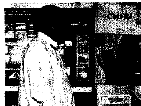
Union Minister visiting the CMFRI stall in the International Seafood Show

The Visakhapatnam Research Centre of the