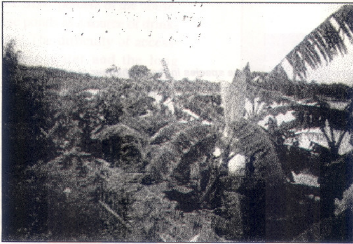
Fig. 3 Banana plantation on the bank of the community tank.