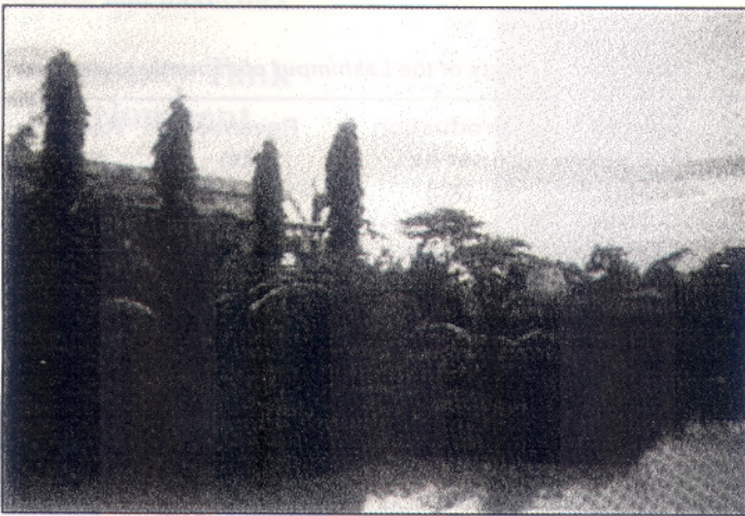
Fig. 4 Herbal medicine garden on the bank of the community tank.