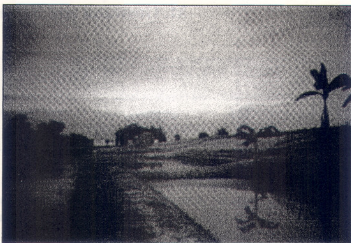
Fig. 2 Nursery ponds along with the side view of the community tank.

programs at district headquarters to disseminate the technology for fish culture to the remote areas.