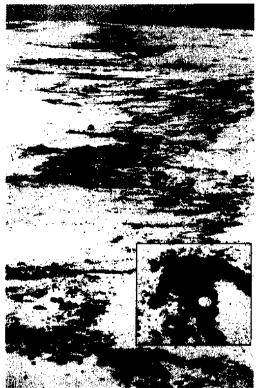
Tar Ball Pollution

Particularly Persistent plastics and including lost fishing nets