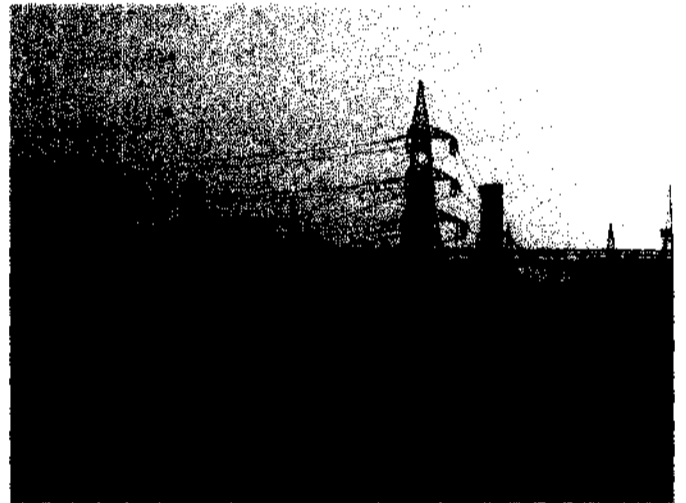
A view of human activity in coastal water

Biomagnification is a phenomenon where levels of toxic pollutants (such as heavy metals and PCB's) increase as we move up the food chain. This can also be called bioamplification. This happens because primary producers only absorb small amounts of toxins. Organisms tend not to get rid of toxins within them, so it accumulates over the course of their life. When one organism eats many organisms and each contains some heavy metals, the metals accumulate even faster within it. But, then herbivores eat many primary producers, so they accumulate a higher concentration of toxins. And then consumers that eat the affected herbivores consume even higher levels of toxins.