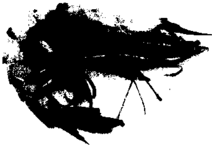
Fig. 1. Plesiopeanaeus edwardsianus (Johnson), female.

off Trivandrum (Lat. 8° 28' 3" N and Long. 76° 14' 7" E), 24th January, 1985 at 1225 hrs.