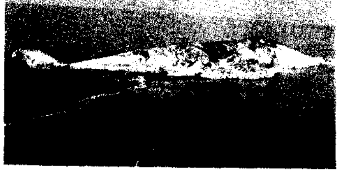
Fig. 1. Full view of stranded whale.