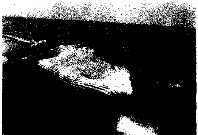
Fig. 2. Enlarged head portion of whale.