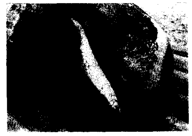
Fig. 2. The head of Risso's dolphin showing the injured portion and teeth on the lower jaw.