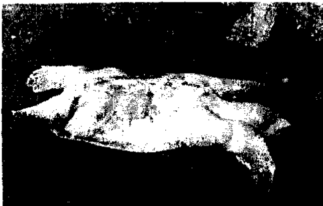
Fig. 2. The loggerhead turtle landed at Digha, West Bengal.