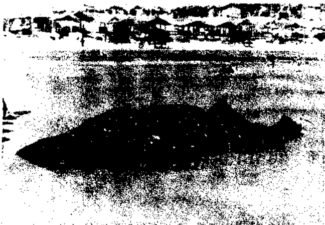
Fig. 1. The whale shark landed at Digha West Bengal.

A whale shark, Rhincodon typus measuring 6.07 m in total length caught by a trawler was landed at Digha Mohana Centre on 8-2-'98 (Fig. 1). The shark with an approximate weight of 400 kg was sold for Rs.2,800.