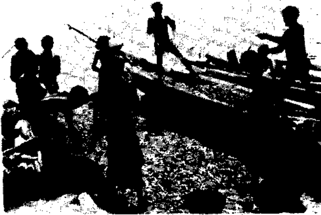
Fig. 1. Oil sandines being removed from the net after landing.

Every year a few tonnes of oil sardines used to be landed at Tuticorin. But there was no landing of oil sardines during 1992 - 1994. In 1995, they reappeared and 77 tonnes were landed ( Mar. Fish Inter. Serv., T & E Ser. Room No. 130 ). During December 1996 118 tonnes