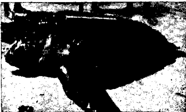
Fig. 1. The leatherback turtle landed at Pamban on 14-2-1989

A female leatherback turtle Dermochelys coriacea (Fig. 1) was captured on 14-2-89, at 0400 hrs in a trawl net operated from a 10 m long mechanised boat, 30 km southeast of Pamban opposite to Dhanushkodi at about 13 m depth. It was brought to the