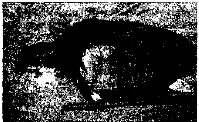
Fig. 2. The Olive Ridley turtle landed at Pamban on 14-2-1989.

Therkuvadi landing centre in dead condition. While observing the leatherback turtle, an Olive Ridley Lepidochelys olivacea (Fig. 2) was also landed by a trawl boat. (Fig. 3). The morphometric measurements (in cm) of the two turtles are given below.