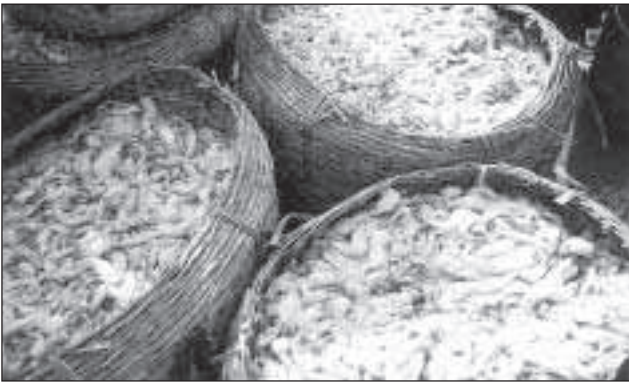
Fig. 1. Catch of Bombayduck filled in big bamboo baskets

For the last three years the Bombayduck catch has increased remarkably at New Ferry Wharf from 2175 t in the year 2001 for the period October-December to 4273 t for the year 2003 for the same period with a corresponding increase in CPUE from 339.84 kg/trip to 549.33 kg/trip respectively. The total estimated monthly catch for December'03 was exceptionally high at 1797 t with a catch per trip of 684.62 kg contributing 18.53% of the total estimated monthly catch.