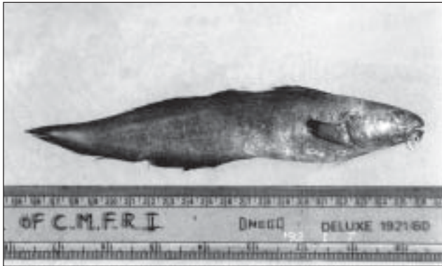
Brotula multibarbata (Temminck & Schlegel, 1846)

Occurrences of Brotula multibarbata commonly known as 'goatsbeard brotula' has been observed at New Ferry Wharf landing centre in Mumbai, in the second trawl net operations. The landings were during the second half of November 2003. It is a pelagic fish in