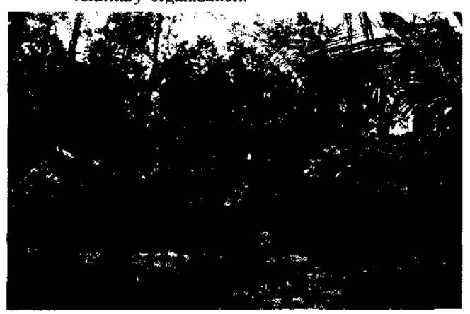
Fig. 5. The vegetable grown in the backyard of a fisherman.

stocking and feeding practices in their own farms as well as other fields in the locality as indicated by the phytoplankton bloom and oxygen levels resulting in premature harvest. They could also be educated on avoiding high cost owing to irrational feeding and use of imported feeds and ill-effects of administering hormones.