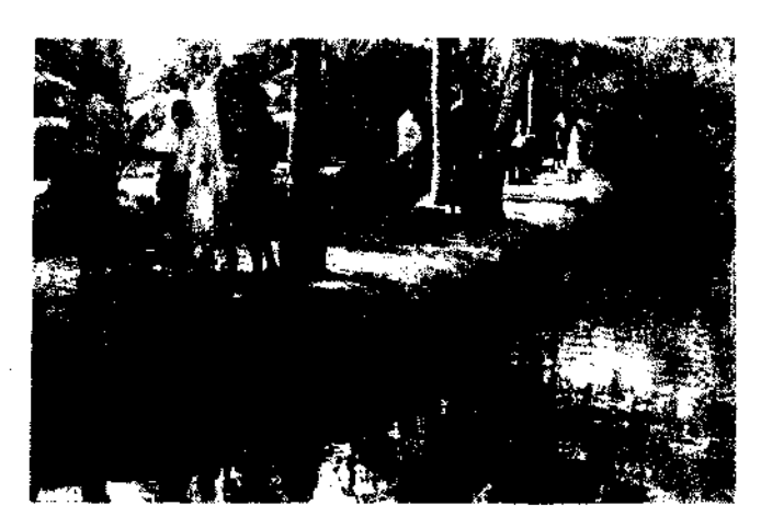
Fig. 1. The coconut grove canal where the prawn culture demonstraion was carried out.

A 10 cent canal in a 60 cent land with coconut trees and shrubs was selected for demonstration. This belonged to a marine fishermen family under joint family system. The daughter-in-law of the family was the one who evinced interest in trying the technology in the family's holding. She was motivated through a lecture in prawn culture and training in seed collection conducted in the village. This proorganised through was 'Matsyamahilavedi', a fisherwomen's society in the village of which she was a member. Matsyamahilavedi has been adopted by the Institute for carrying out studies under the present research project.