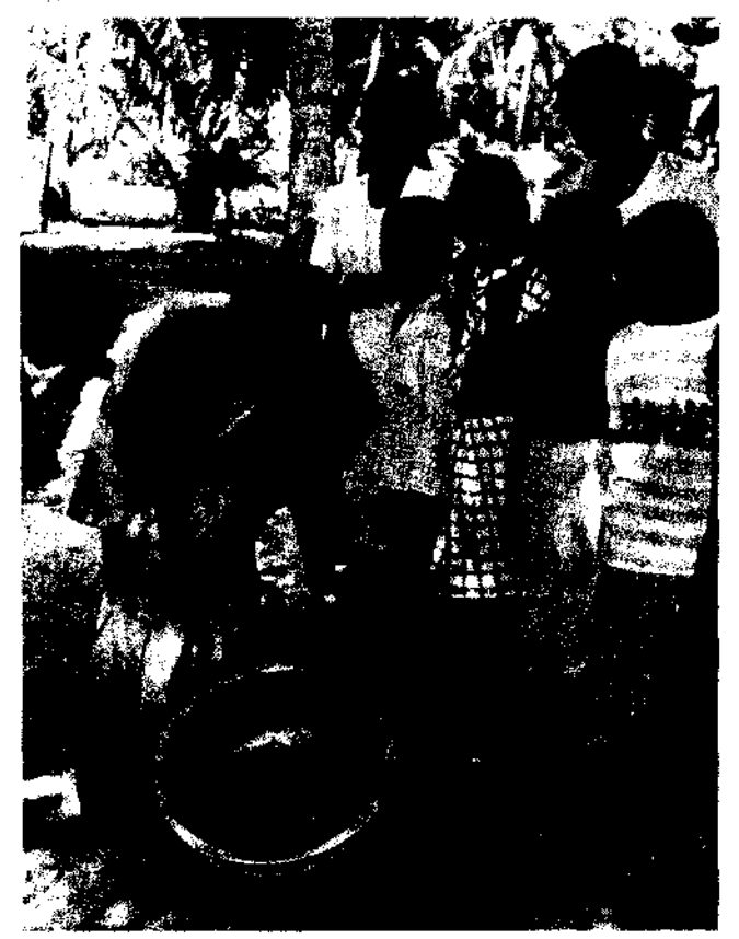
Fig. 3. The farm-woman with some of harvested prawns.