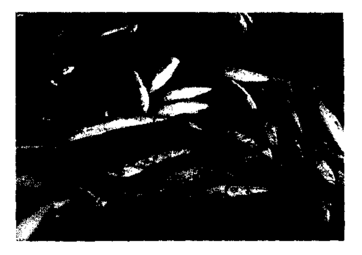
Fig. 5. Gill net catch being unloaded at old light house, Veraval.

Ribbon fish and scianenids formed 13.7% and 12.1% of the catch respectively. However, the most significant change in the trend of the fishery was observed in the case of prawns. From a mere 2,335 tonnes in 1979-'80, the prawn landings increased to 27,304 tonnes in 1990 and further to 48,146 tonnes in 1992. The increase in catch was very high and unproportionate to the increase in effort.