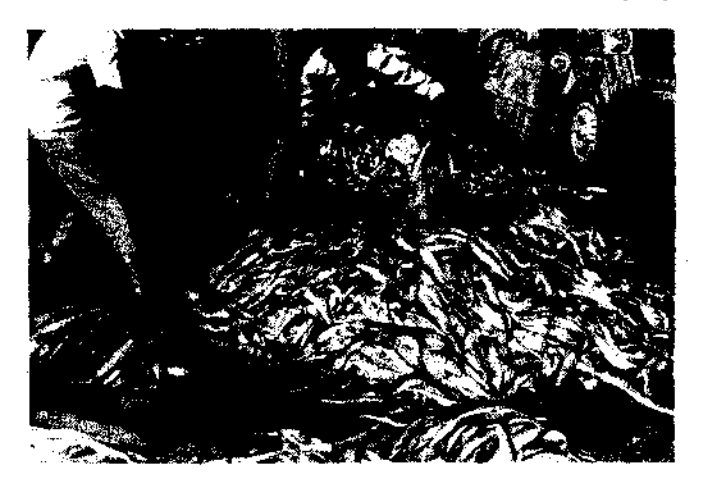
Fig. 6. Ribbon lish being unloaded at old light house, Veraval.

Among the penaeid prawns Parapenaeopsis stylifera, Metapenaeus monoceros and Solanocera crassicornis formed most of the catch. The spiny