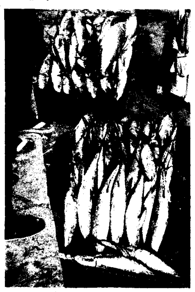
Fig. 4. Gill net catch being unloaded at old light house, Veraval.

The composition of catch showed an absolute dominance of crustaceans. Crustaceans as a group formed 54.7% of the total catch.