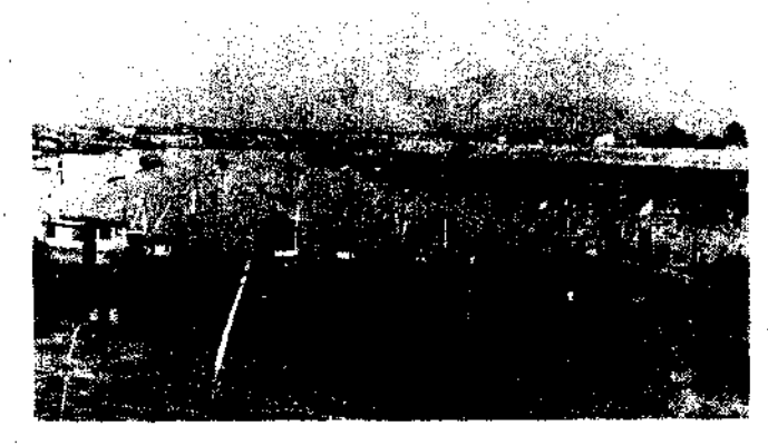
Fig. 2. Fisheries Harbour, Bhidiya, Veraval.