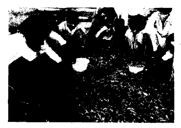
Fig. 8. Part of the long trip prawn catch.

Compared to the landings during 1983 the percentage composition of the finfish groups to the total landings has substantially changed during 1992. This is due to the increase in the crustacean catch especially of Acetes . Acetes catch, which was only 2.7% of the total in 1979-82, increased during the past years and formed 43.2% during 1992. However, despite the change