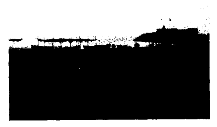
Fig. 8. Gill net landing centre, Jaleswar, Veraval.

i. A gradual reduction in the cod end mesh size from 20-25 mm to 8-12 mm in just a period of five years.