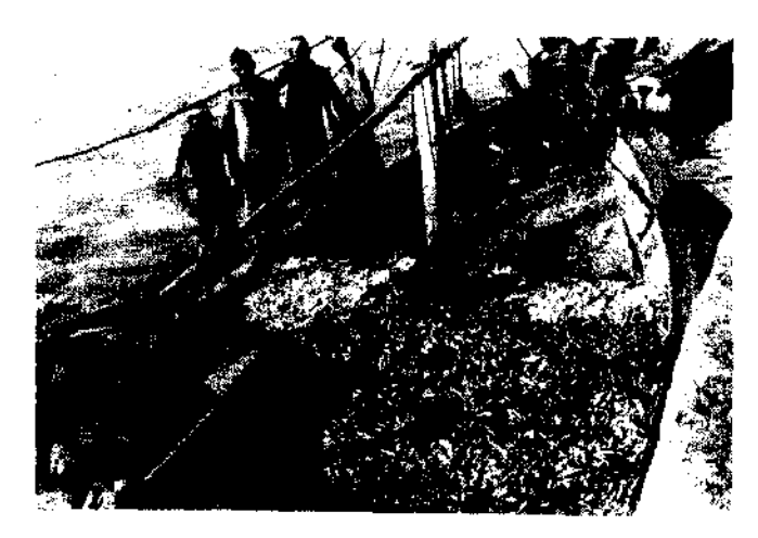
Fig. 7. A trawler returning after a long trip, from the northern Kutch.

lobster, Panulirus polyphagus and the sand lobster, Thenus orientalis represented the lobster fishery.