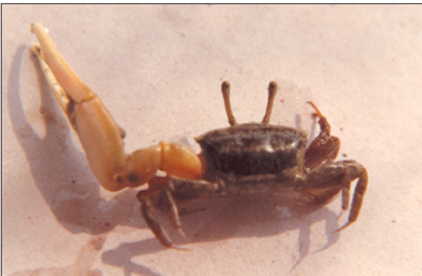
Uca lactea annulipes