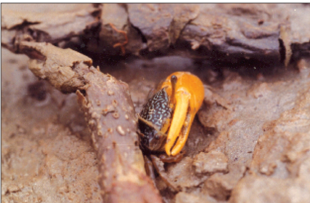
Uca triangularis bengali (male)