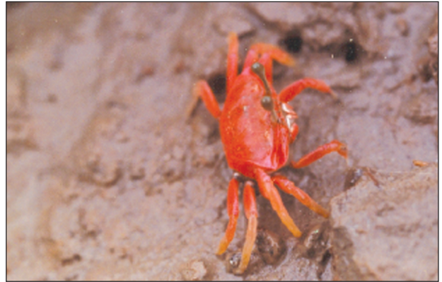
U. acuta acuta (female)