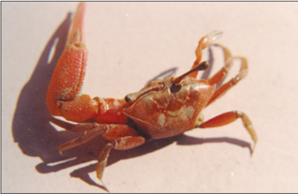
Uca acuta acuta (male)