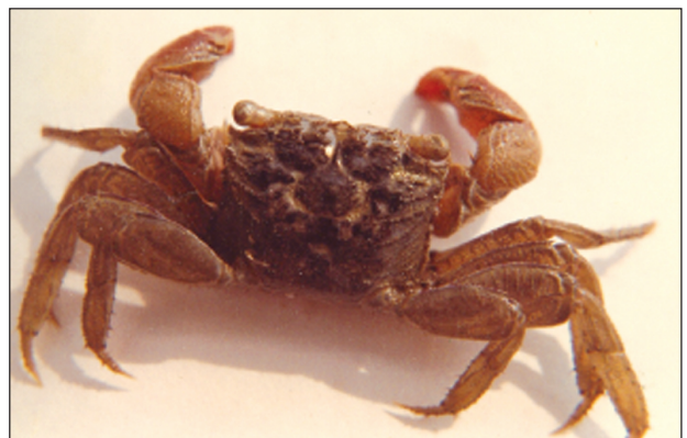
Sesarma chiromantes bidens