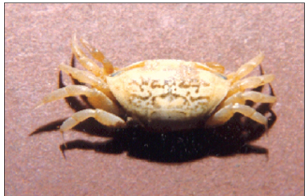
Uca triangularis bengali (female)