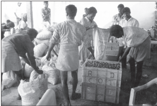
Fig. 1. Clams transported in bags to the fishing harbour

During the last two decades, clams were exploited in large quantities from estuaries and backwaters to feed shrimps cultured in the commercial ponds along the east coast of