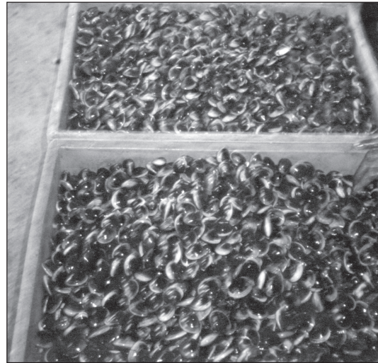
Fig. 2. Clams in tubs arranged for depuration

India. In recent years, clam meat is served as a dish in hotels in places like Bangalore,