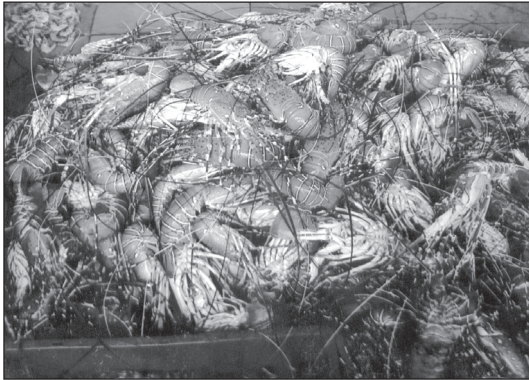
Fig. 1. Trawl catch of Panulirus polyphagus at Mumbai

mm. Ninety-seven females were measured and the size ranged between 215 mm to 375 mm and the mean size was 264 mm. A catch of similar magnitude was also observed on