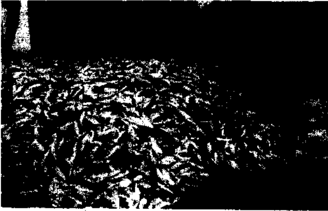
Fig. 1. Portion of the catch.