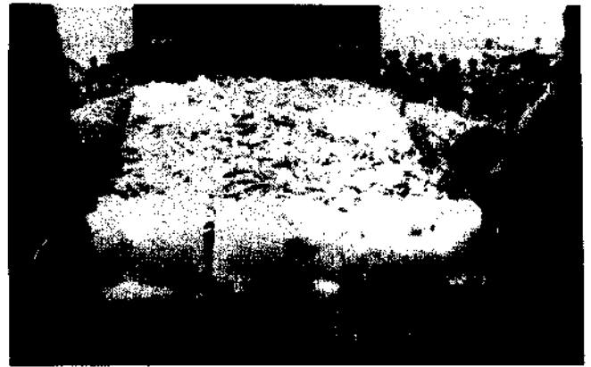
Fig. 3. Truck load of iced fish.