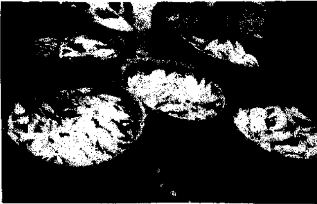
Fig. 2. Auctioning of the catch at the landing centre.