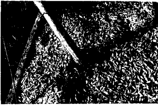
Fig. 1. Trawl catch of Nemipterus sp. at Veraval.