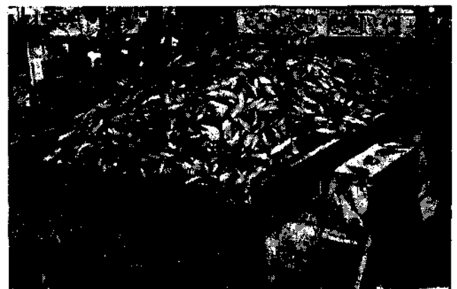
Fig. 2. Nemipterus sp. being transported through auto carriers in bulk quantities at Veraval.

Size range of N. mesoprion was 90 to 200 mm (TL) with modal size of 130 mm. In N. japonicus the size ranged between 140 and 200 mm with modal size of 160 mm. It is presumed that the shoal belong to the first year group.