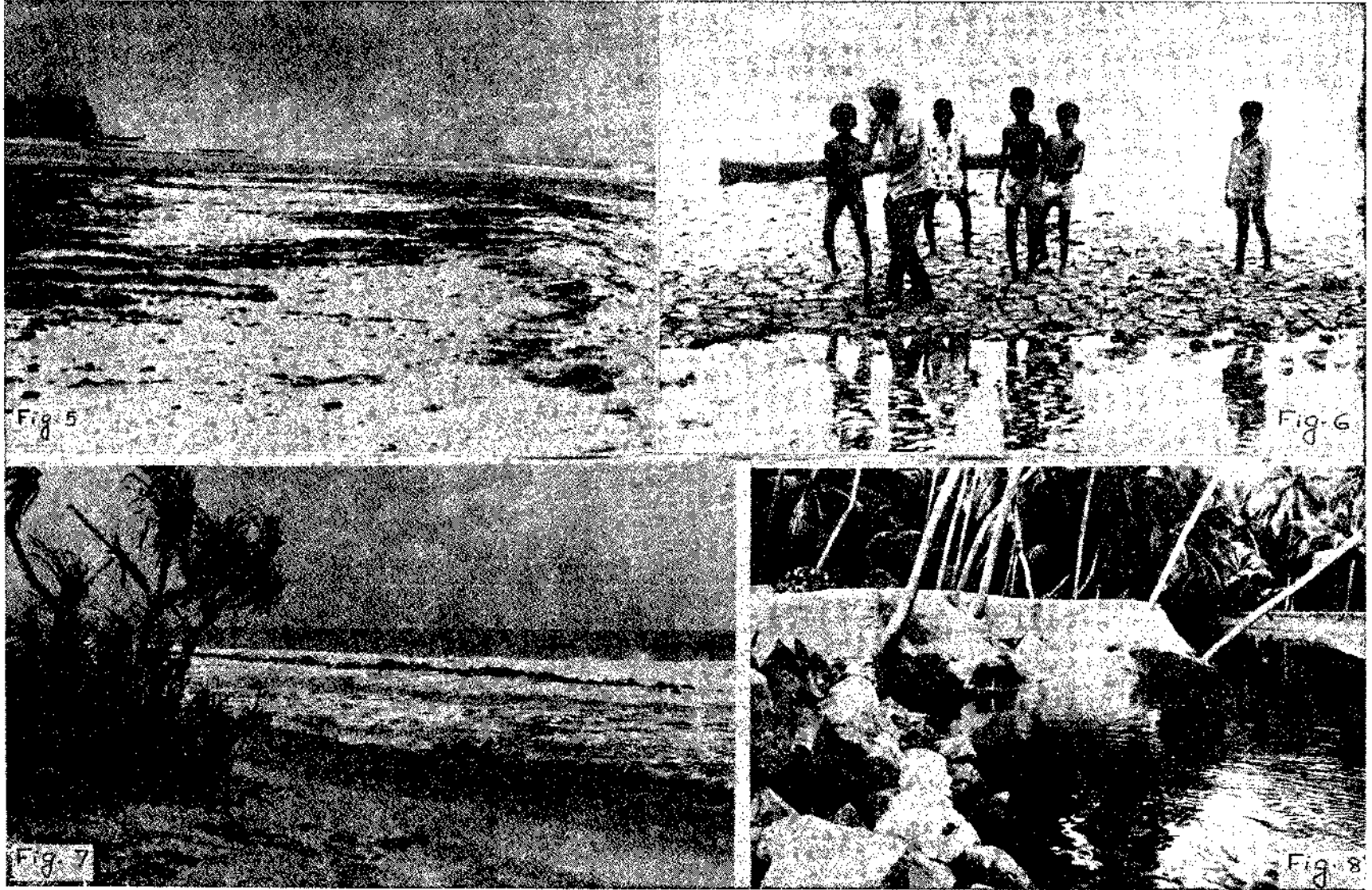
Fig. 5. Streaks of mud seen on the beach at Purakkad mud bank area. Major part of the mud is covered by sand(1980). Fig. 6. The mud thrown on to the beach at Purakkad after being baked in the sun (1980). Fig. 7. The sea has come far interior into the land. In the water is seen the sea wall which was no barrier to the roaring tidal waves. A scene at Ambalapuzha (1980). Fig. 8. Vast areas of unprotected beaches were eroded along the Alleppey-Quilon coast and the sea had come to the coconut plantations. A scene at Purakkad (1980).