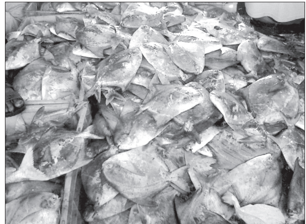
Fig. 2. Heavy landing of Chinese pomfret at New Ferry Wharf

Chinese pomfrets are found in the shelf waters at 80 m depth off Mumbai and in the Gulf of Kutch. Abundance of this species varies from year to year and generally they are not caught in such large numbers. Such an unprecedented catch of adult specimens is reported for the first time.